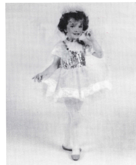
Tiffany - 1985

Assistance from the fund can be applied for by filling out the proper information and mailing this pre-addressed brochure to the Royal Arch Masons Heart Foundation, or you can call 1-800-813-9900 and give us the information. The request will receive our immediate attention.